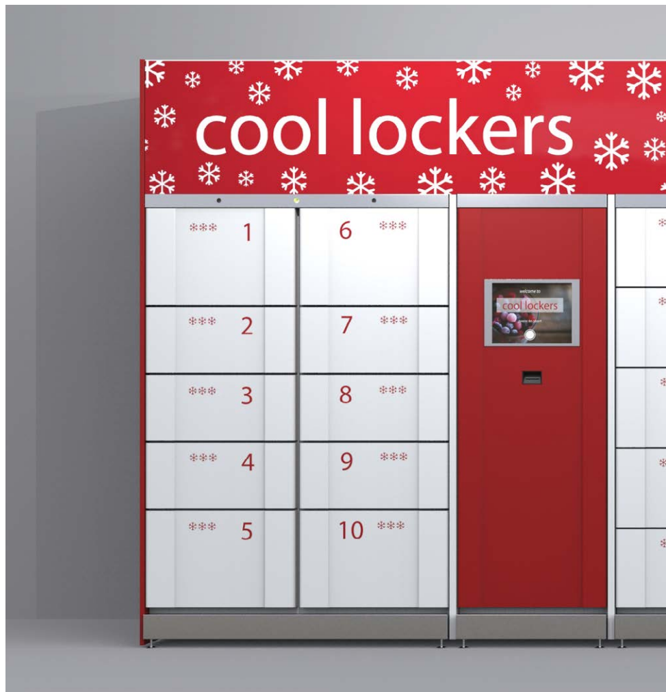
24-hour delivery lockers

If the goods haven't been paid for in advance, the customer can pay at the delivery lockers.